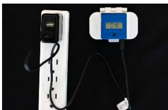
Wall Socket Power Adapter

Plug the provided USB Power Cord into a wall socket power adapter (not provided) or into a compatible USB slot. The sōna LFA Cube Reader will automatically turn on with first insertion of batteries/connection to power cord. Following initial power-on, press the button on the cube reader once to power on.